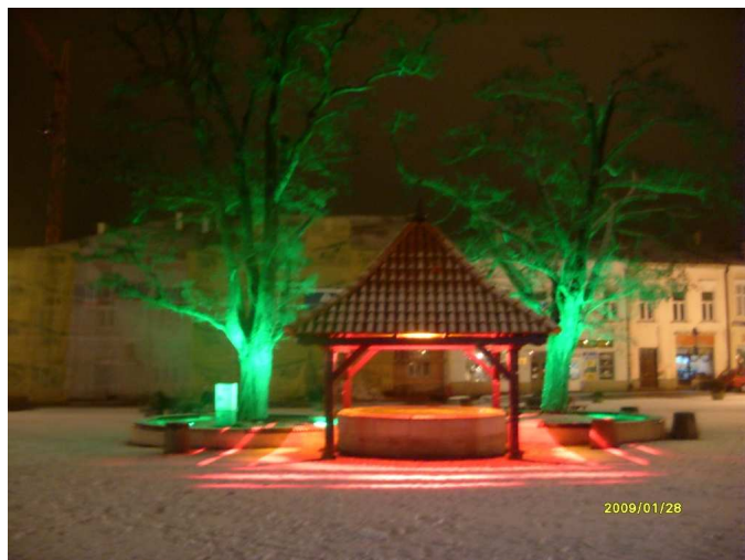
The best view of Krosno.

night. You must see the combine of green and red light on the tree. On the one side there is Belfry Tower which is very beautiful, a symbol of the town with its onion dome and three large bells one of which is the fourth largest in the country. There is also the clock made in the local factory on Belfry Tower. On the other side there are old magnificent buildings.