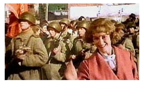
The archival footage is usually tinted and in a At times Marko is seamlessly edited into number of sequences used as back projection, drawing attention to both its presence in the film and the fact that the image has been manipulated.

But, as we have seen, it has been the inclusion of archival footage that has aroused most attention and criticism. The combination of different forms and genres: feature film and documentary, historical drama and personal memoir, lyric poetry and farce, serve to highlight the difficulties and tensions of representing the past but also how that past has been inscribed in a multiplicity of texts-films, books, poems, art works-thus creating a specific national mythology. The different texts and genres within Underground do not sit comfortably together but create their own internal tensions within the film text itself.