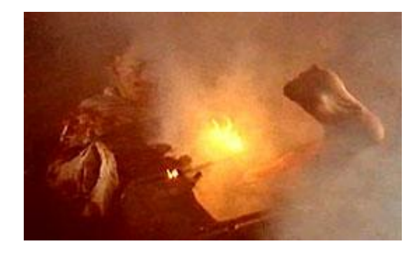
A cartoon hero? While escaping from captivity in a trunk Blacky succeeds in blowing himself up with a grenade.

The question arises, then, how did this radical critique of Yugoslav culture in Kusturica's work apparently turn into its opposite? Pavle Levi notes that the central feature of Kusturica's aesthetics, "the eruption of enjoyment in the public sphere" (85), is strongly indebted to the SNP. This aesthetic manifests itself in the exuberant wedding scenes, the sleepwalkers who tread a thin line between the rational and the irrational, the seemingly inexhaustible alcohol-induced states of trance and excess as well as the so-called magic realism.[7] Kusturica's aesthetic is above all an aesthetic of excess which will find its fullest expression in Time of the Gypsies (1989) and Underground . In the early films this excess functioned as critique, very much in line with the main principles of the SNP, through Kusturica's opposition to both socialist dogma and newly emerging nationalist discourse that was replacing it: "What the group [SNP] aimed for was not merely a negation of the popular content pertaining to specific cultural ideology