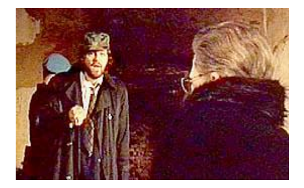
Kusturica plays a cameo role as a war profiteer negotiating the purchase of arms from Marko, flanked by UN "blue helmets."

In this play of mirror images where performance and reality, truth and fiction, past and present become blurred what we should not forget is that what is being rewritten is History itself, both in terms of the film's diegesis (Marko's memoirs) but also in relation to Underground as a text.