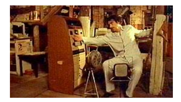
In order to fool the partisans living underground that World War II is continuing, Marko stage manages an extremely elaborate theatrical setup, including bombing raids, old news reports and constant updates on the progress of the war.

If we scrutinize the film a little closer, though, this ideal image of national heroism becomes a little difficult to sustain. As well as being an international arms smuggler, Marko is a rather awful nationalist poet and something of a stage director himself.