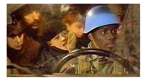
UN "blue Helmets" transporting refuges through the underground tunnels for a price, as the UN are consistently shown to be complicit in the recent violence in Bosnia.

What we can see here is the difficulty facing critics of nationalism in the Balkans, of circumventing that ideology, or of maintaining a position outside of it that is not itself open to recuperation by nationalist discourses. I have argued in this paper that, however, flawed and contradictory, it is possible to read Kusturica's Underground against the grain of ethnic nationalism and as a critique of this process rather than an apology for it.