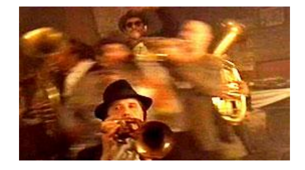
Here the dissipation of energy is achieved through the band performing on a spinning wheel which spins at an ever faster rate until the image becomes a blur.