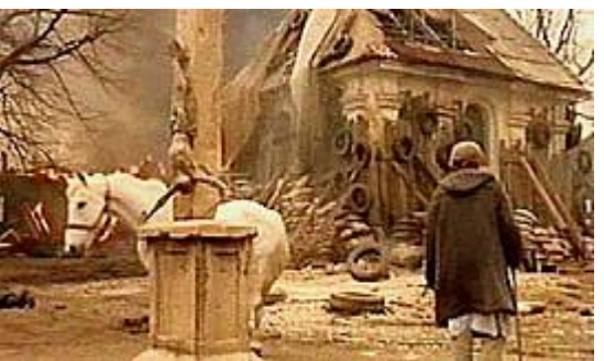
In one of many cinematic intertextual references in the film, Kusturica cites Hitchcock.