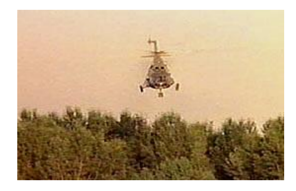
Above: A helicopter rises above the tree line and swoops down upon the beach in a shot reminiscent of Apocalypse Now (1979), intertextually linking Underground with a tradition of critical anti-war filmmaking.

Left: A poster for the partisan blockbuster Walter Defends Sarajevo (1972). The film Underground 's intertextual reference to Yugoslav new film of the 1960s and 70s again links it to a tradition of critical and anti-war filmmaking, rather than nationalist propaganda.