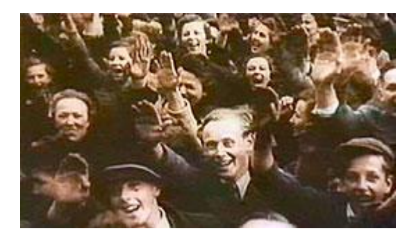
In his controversial use of documentary film footage in Underground , cheering crowds are shown welcoming Nazi troops into Zagreb (1941).

A key point of contention in the film was the use of documentary footage portraying Slovenes in Maribor and Croats in Zagreb cheering and welcoming Nazi troops in contrast to the footage of devastation wrought on Belgrade by Nazi bombers, the fairly obvious implication being that the Croats and Slovenes were collaborators while the brave Serbs resisted the occupation. Kusturica defended his use of this documentary footage, arguing that he was trying to counter the selective humanism of the West in showing only the Serbs as the aggressor. He was, he insisted, against ethnic cleansing of all kinds, whether it came from Bosnians, Croats or Serbs.[15]