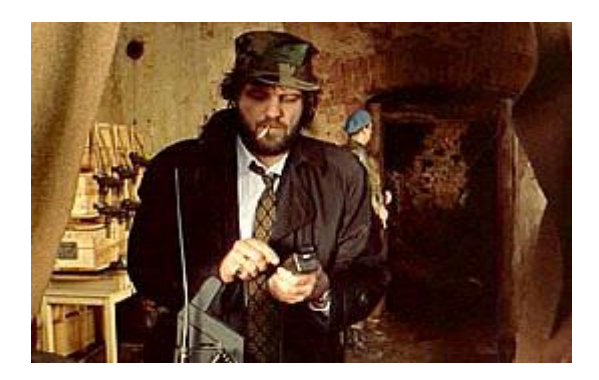
Kusturica concludes his arms deal, selfconsciously drawing attention to the role of filmmakers profiteering from the conflict.

As if to underscore the director's own self-consciousness of, or complicity with, this fabrication of history towards the end of the film, when we move to the present conflicts and wars of succession, Kusturica himself plays a cameo role in the film as an arms dealer and war profiteer. This very overt narrative repetition and doubling of characters