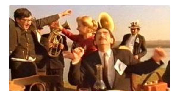
Bato celebrates the miraculous recovery of his legs in the final scene of the film in what initially seems to be a utopian reprieve for all the misery that has gone before it.

The two weddings, then, are quite clearly linked within the film and are not simply scenes of exuberant celebration but sites of tension and ultimately violence.[19]