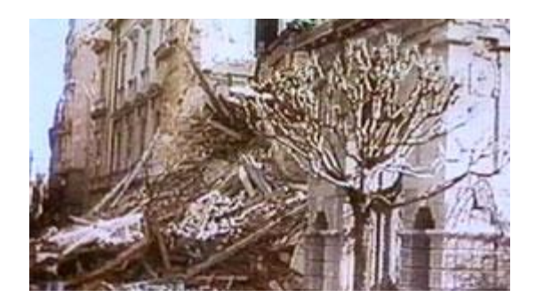
The scenes in Zagreb are juxtaposed to the devastation of Belgrade by Nazi bombers (1941).

Slavoj Žižek also intervened in this debate with a short article entitled "Underground, or Ethnic Cleansing as a Continuation of Poetry by Other Means" (1997a) which subsequently appeared as a section in The Plague of Fantasies (1997b) and his influential essay "Multiculturalism, or, the Cultural Logic of Multinational Capitalism" (1997c). As Žižek's reading of the film has set the tone for the wider reception of the film by many on the Western European Left, I want to follow his argument here. Žižek took as his starting point not so much the film itself as the political controversy surrounding it and Kusturica's own, often unfortunate, response to the criticism.[16] The political meaning of Underground , argued Žižek, "does not reside primarily in its overt tendentiousness, in the way it takes sides in the post-Yugoslav conflict—heroic Serbs versus the treacherous, pro-Nazi Slovenes and Croats—but, rather, in its very 'depoliticized' aestheticist attitude" (1997c, 37).