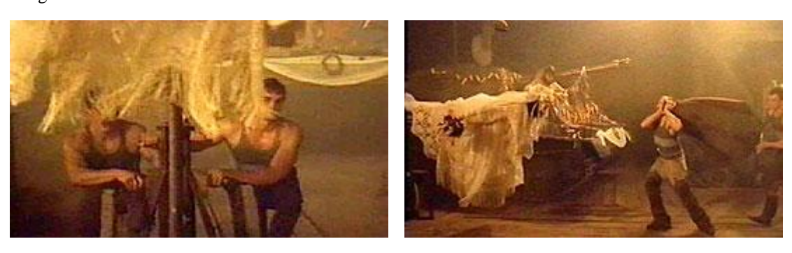
The magic realist effect of this image, however, is The camera then cuts to a medium side shot