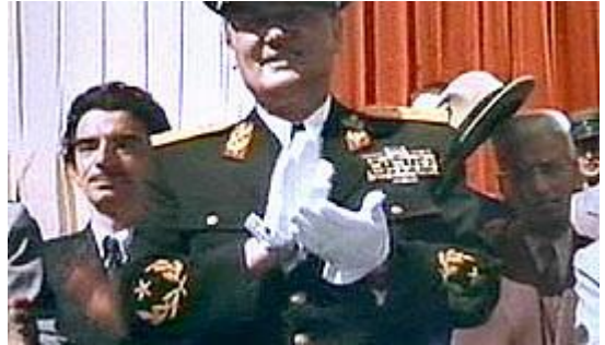
sequences with Tito, reminding us of the old Stalinist practice of editing out discredited figures from visual images and hence from the historical record.

Documentary is conventionally understood to be the opposite of a feature film. A documentary presents us with "real" information and historical facts; it aims at the truth