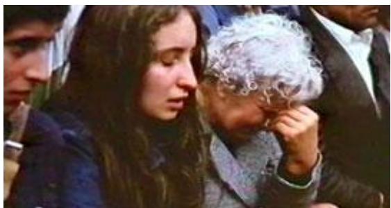
Zagreb, overlaid with the sound track of "Lili Marlene," a song with strong Nazi connotations.