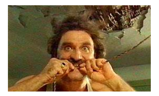
Blacky in the film Underground is often cited by critics as exemplary of Kusturica's celebration of the "Balkan Wildman," although he appears to be more like a character straight out of a silent era slapstick comedy.

The New Primitivs were militantly provincial and anti-intellectual. Rather than rejecting Balkan stereotypes, such as the Balkan "Wildman," they embraced these stereotypes and exaggerated them. They adopted an ironic stance regarding official culture and drew upon folk culture as well as the tradition of Yugoslav naïve painting in order to subvert it from within. While the movement was not directly involved in film making, Kusturica's early films were clearly influenced by the movement's aesthetics and he was an associate of the group.[6] As Dina Iordanova observes, Kusturica's early films "confirmed his reputation as an indigenous director" through "the truthful and self-confessed devotion to his roots" (2002, 50). They also confirmed his status as an outsider developing a critique of official culture. According to Goran Gocic, Kusturica was seen to embody and indeed celebrate many of the characteristics of Sarajevo "buddy culture" and its cult of marginality (47-82).