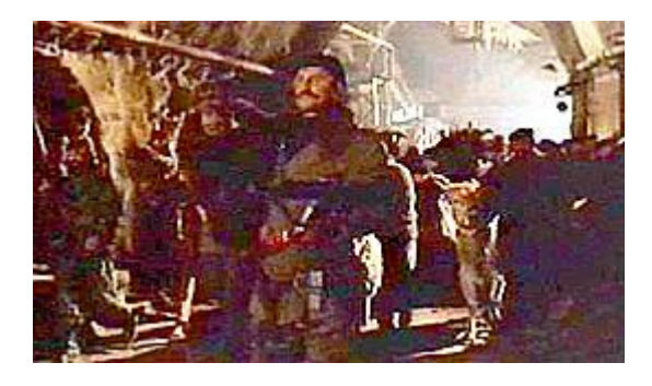
As Blacky leads his men and refugees back into the cellar he abandoned 30 years previously, the utter senselessness of these cycles of violence is underscored.